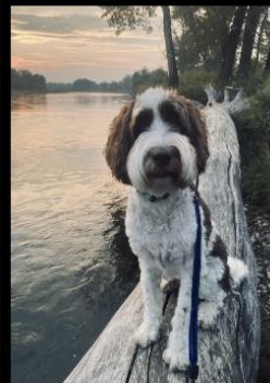
Murphy Grade 8

These four dogs have completed their training and are eager to show some love at TCS once or twice a week. Two are new to the team and two are veterans.