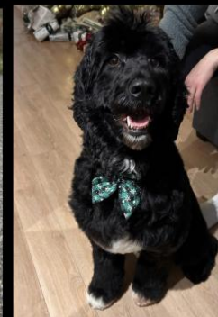
Kona Grade 9